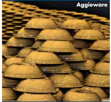
Segundo Services Center